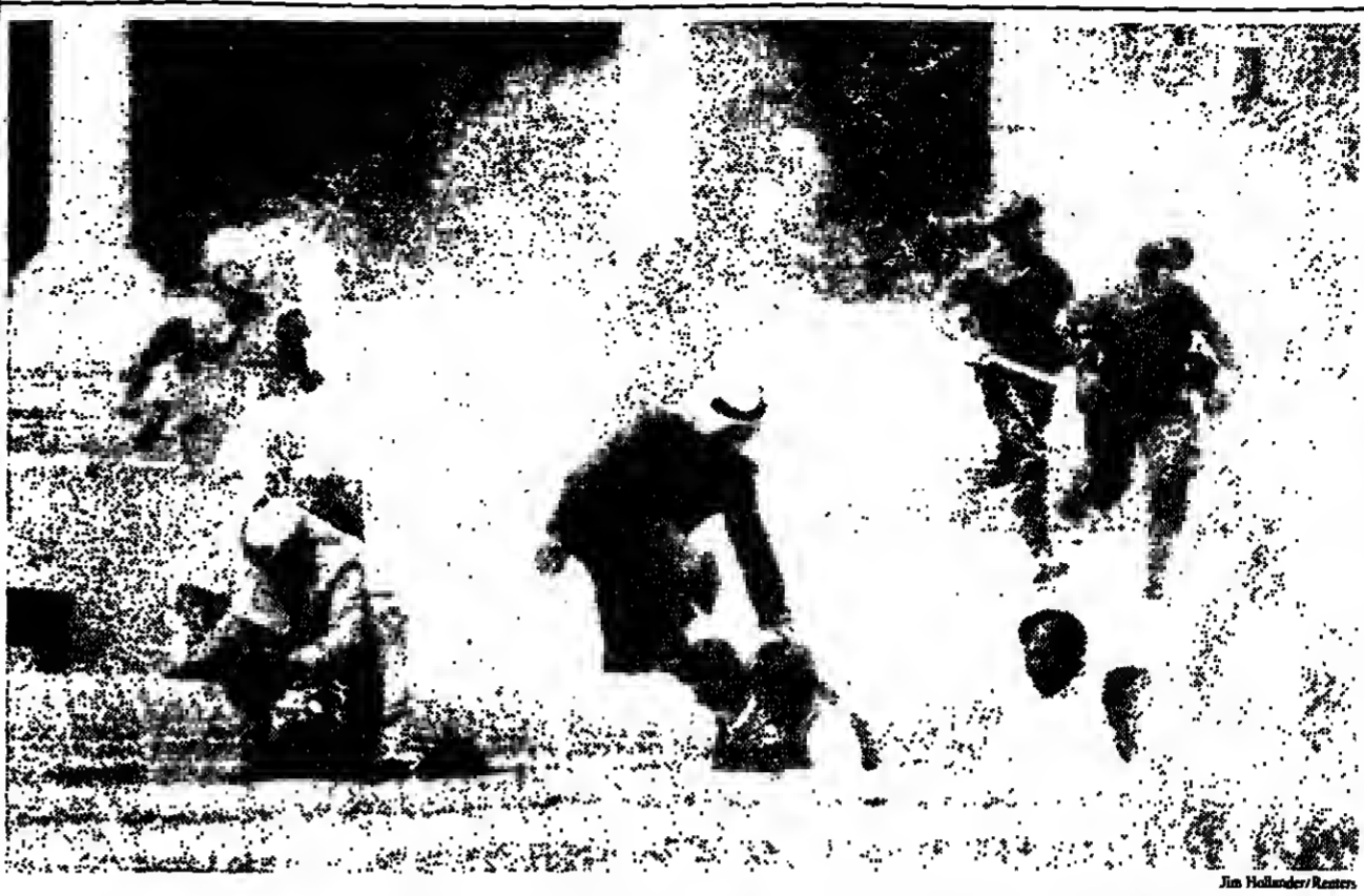
TURMOIL AT TEMPLE MOUNT — Palestinians fleeing a charge by Israeli policemen Friday at the Temple Mount in Jerusalem on the final sabbath of the Moslem holy month of Ramadan. Two policemen and 15 Arabs were reported injured in the violence, which started as Moslems demonstrated after leaving the Al Aqsa mosque, hurling stones at a police station.

TOKYO — Japan reported Friday that it had reduced its trade surplus for the 12th consecutive month in April, but economists said further reductions would be more difficult to make because of a sharp rise in exports.